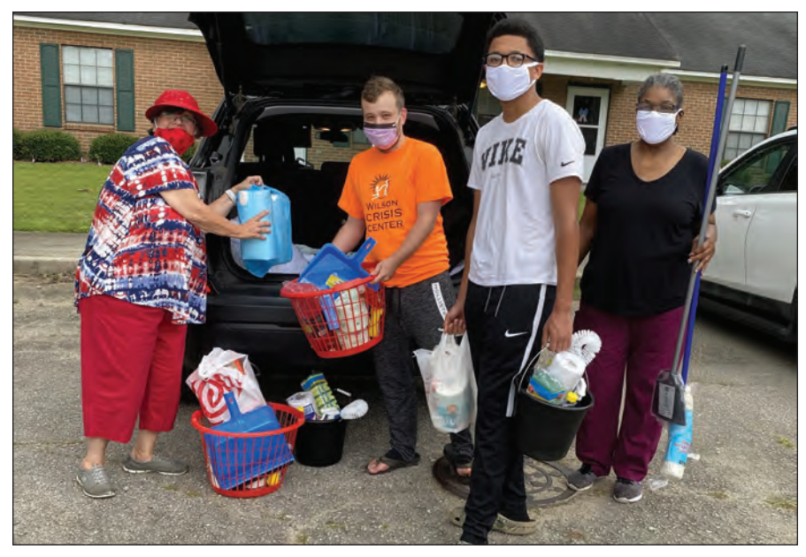
Volunteers deliver donated 'buddy buckets' to citizens served by the Crisis Center.

WILSON OFFICE 2605 Forest Hills Road, Suite A ROCKY MOUNT OFFICE 4082 Capital Drive For Appointment Call 252-293-9898 www.nckidneycare.com